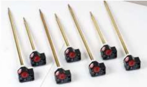
Figure 1 Thermostat