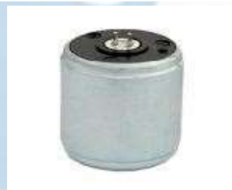
Figure 3 Geo Phone