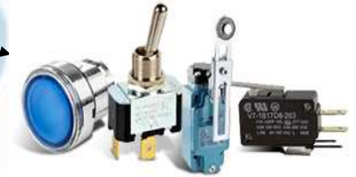
Figure 5 Switches and Relays