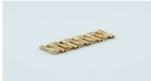
Figure 2 Connectors