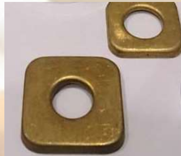
Figure 6 Sanitaryware