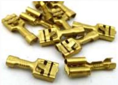
Figure 1 Terminals