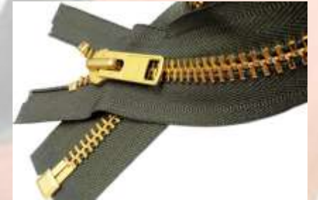
Figure 4 Zippers