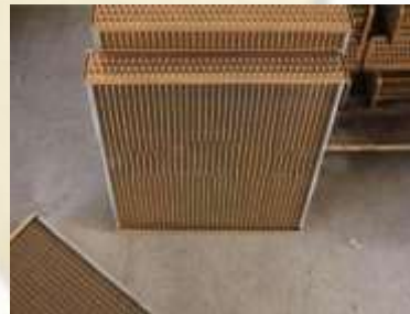
Figure 2 Radiators