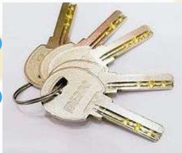
Figure 5 Keys