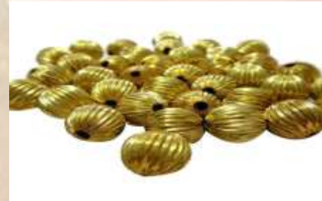
Figure 3 Imitation Jewelry